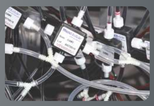
Degassing System for Nano & Max (Optional for Hexa)