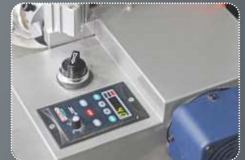
Pneumatic Feed & Fabric Takeup