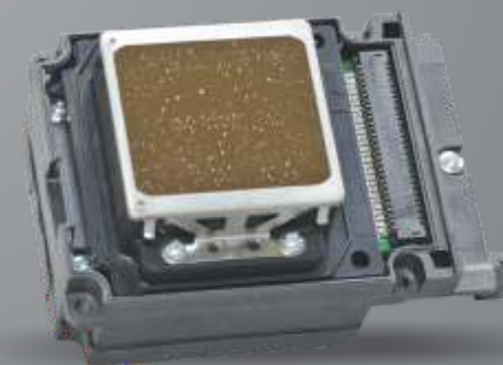
EPSON Printhead 6 colours

Economical Production LOW MAINTENANCE COST