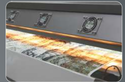
Under Fabric Heater and Tunnel Dryer