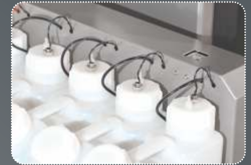
Positive Ink Pressure & Bulk Ink System